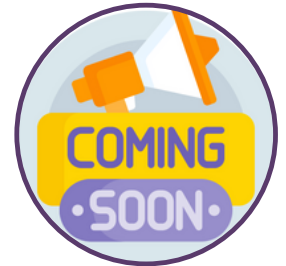
DIRECTOR OF YOUTH OUTREACH